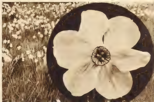
PO T'S NARCISSUS